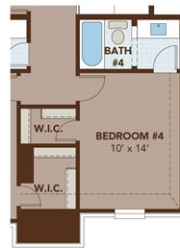
Opt. Bath #4